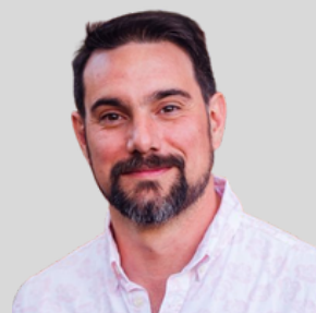
Former Mayor of Flagstaff Paul Deasy